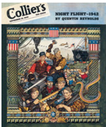
Collier's Weekly cover commemorating Labor Day, September 12, 1942.

The English pages of the 1940 Beaconsfield edition attempted to mimic the geometry of Szyk's pages. Where Szyk had Hebrew text,