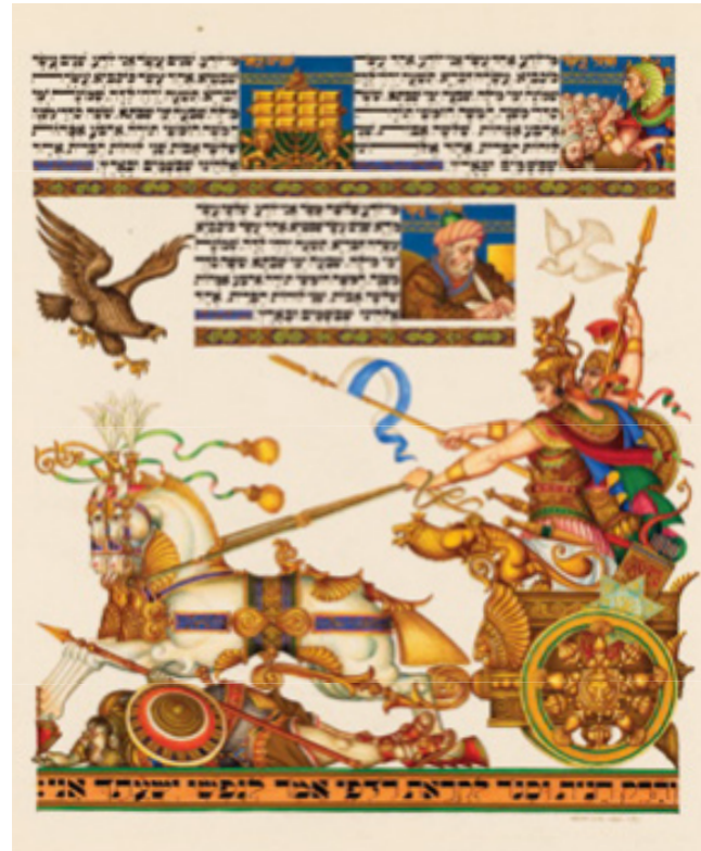
Pages from the 2008 edition of Szyk's Haggadah. Clockwise from top left: "Blessed art Thou, Lord God, King of the Universe, Who sanctified us by His commandments and has commanded us concerning the removal of Leaven." Top right: "The four questions" asked by the youngest child present at the Seder meal. Bottom right: Psalm 35:3: "Ready the spear and the javelin against my pursuers, and tell me, 'I am your deliverance.'" Bottom left: Exodus 12:27, for the second night of Passover: "So and ye shall say, this is the offering of the Passover."